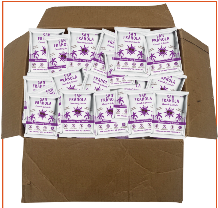
PHOTO OF MASTER CASE

Distributed By: San Franola Inc. San Francisco, CA 94115